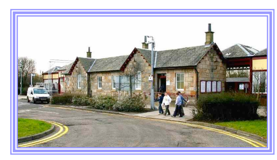
Milngavie Station 2012

The Glasgow and Milngavie Junction Railway opened in August 1863 and was operated by the North British Railway. By 2009 it had just under a million passengers annually and now provides services to Edinburgh alongside normal Glasgow services The station is a "B Listed" building.