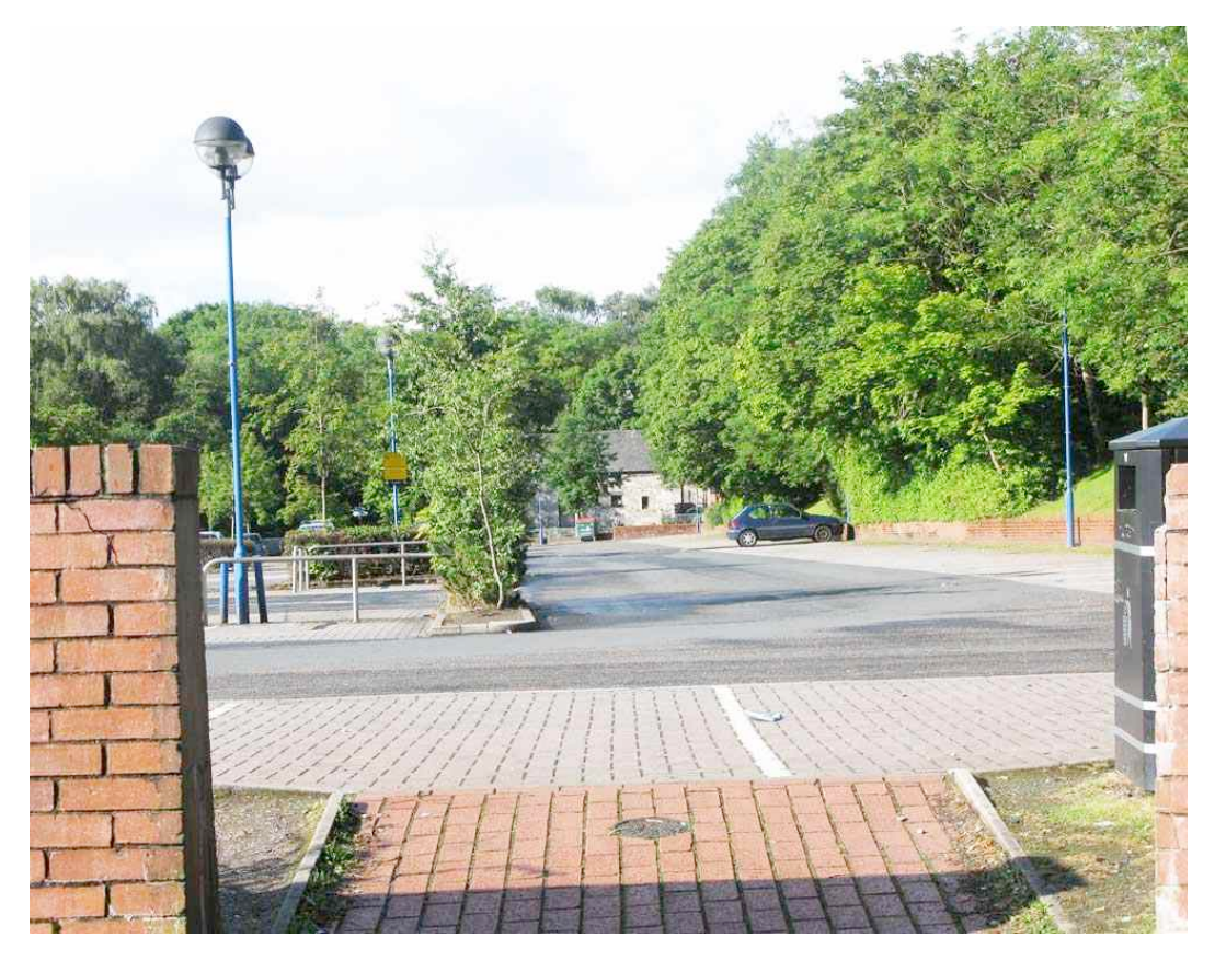
Gavin's Mill from Allander Way at the Fish Pass