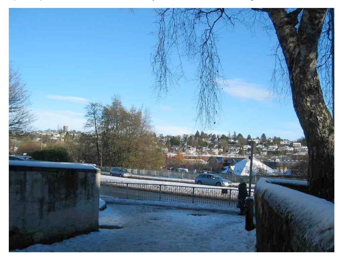
Open aspect from Ashfield Road, southern end of Conservation Area.

The Reporter did not assess the similar impact on views from the southern end of the conservation area (i.e. south of the telephone exchange, including the B listed Corbie Ha' on elevated ground in Ashfield Road). However, these would similarly lose their open aspect across the Allander valley towards the east of Milngavie.