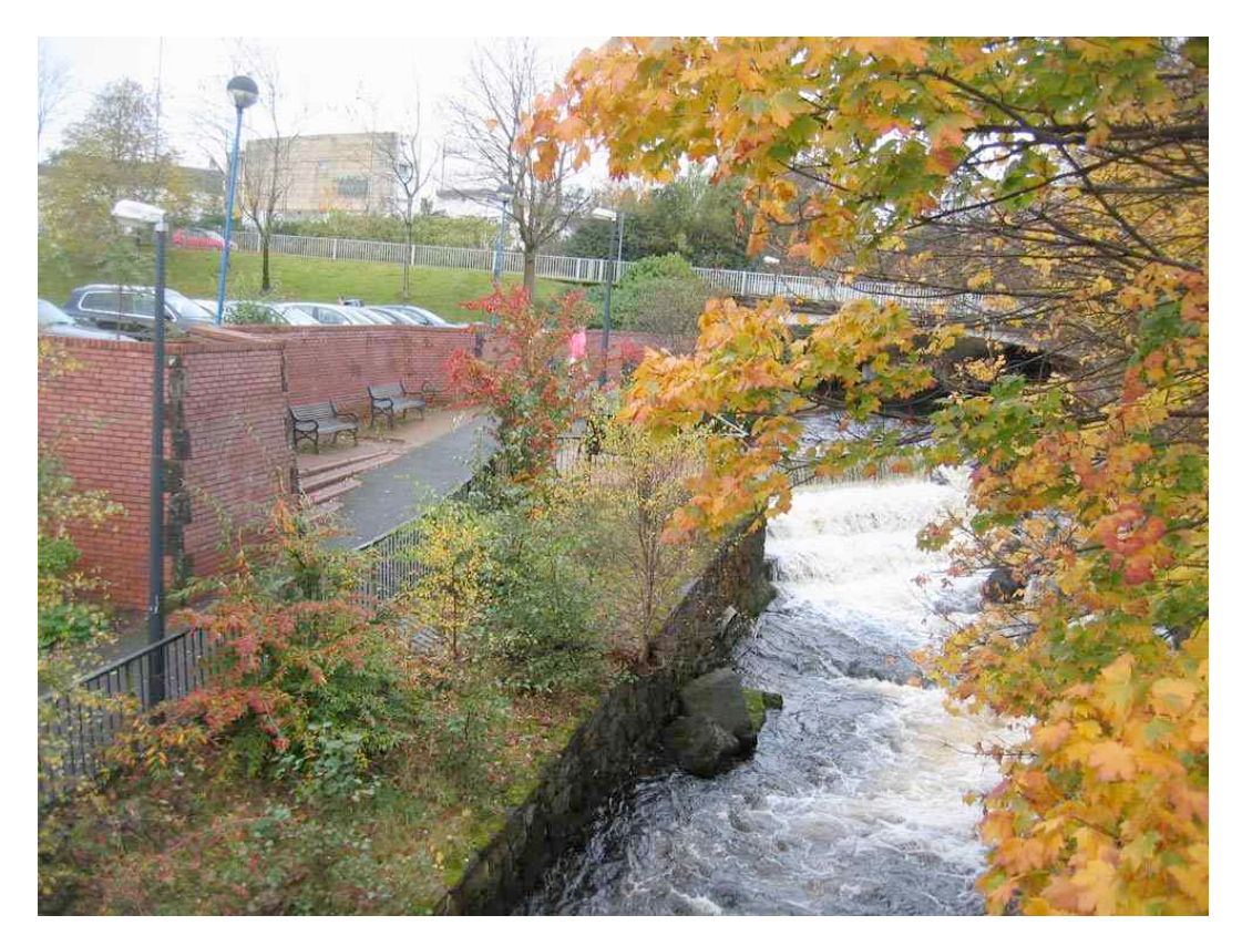
Gavin's Mill falls and Allander Way from bridge in Gavin's Mill Road. (Fish Pass hidden by trees)

View of Mill from bridge in Gavin's Mill Road