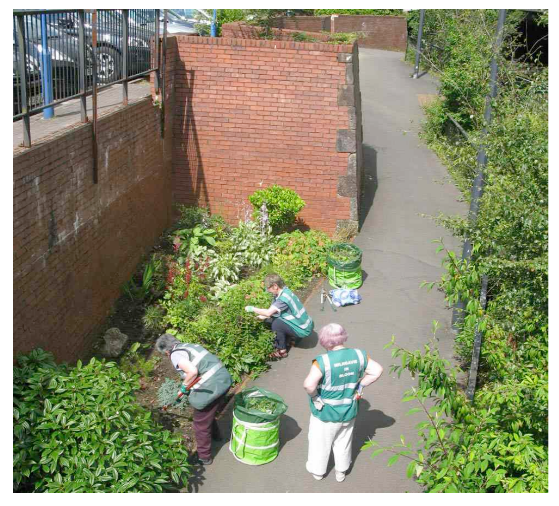
Allander Way at Fish Pass with team from Milngavie in Bloom