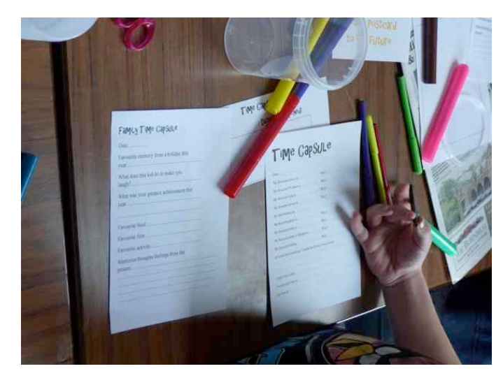
Time Capsule Being Prepared.

Milngavie had its own soft drinks factory, Garvie's, whose bottles of lemonade and cream soda were a familiar feature of local childhood in the 1960's and 70's. The firm produced a wide range of carbonated drinks and even distributed cider and other alcoholic drinks, but they were probably best known for their classic soft drinks such as cream soda.